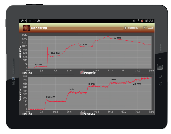
Fig. 2. Measure values displayed on bedside Client tablet. Monitored parameters are: endogenous glucose and exogenous propofol anesthetic.

The client Android application collects data from several hardware biosensors that directly measure metabolites of each patient. In this way, the concentrations of the most critical biomolecules measured by the sensors are available to be immediately displayed on a tablet placed near patient's bed. The aim is to offer the same potentialities of the already largely used patient monitors. Filtering options on incoming raw data are provided to reduce noise and to ensure smooth traces of the measured concentrations. Moreover the