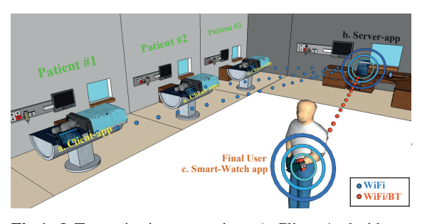
Fig.1. IoT monitoring scenario: a. ) Client-Android app gathers data from each patient's biosensor, b. ) Server-Android app redirects data to a c. ) Watch-AndroidWear app to keep the medical doctor continuously connected.

Technology Wearable is considered as the revolution in the area of Internet of Things (IoT) [1]. Indeed, IoT satisfies increasing request of the always-connected devices to provide information accessible time and from any place [2]. In this context, wearable devices, e.g. smart-watches, can be highly exploited also for wellness monitoring or real medical applications thanks to their small-size, low-cost,